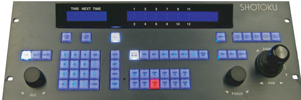
12 Channel TR-S Panel with Optional Iris Control